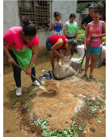
FUNDACCO provides training to facilitators following the delivery of the summer program

Although the program officially ends at the end of January, activities and training of the facilitators is made available for those who want to participate.