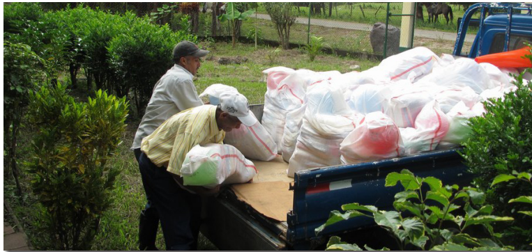
File photo of ACHUAPA Disaster Relief Efforts - 2011

In November 2020, when Hurricane Iota ravaged the Caribbean coastline of most Central American countries, Nicaragua was not excluded.