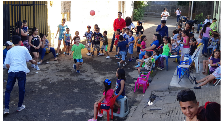
Delivery of the summer program by facilitators in one of the barrios

For more information www.rootsofchange.ca