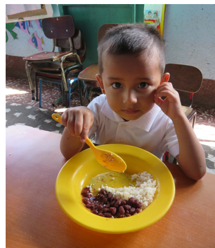
NICA Preschool Program one of our Ongoing year-to-year programs. Learn more on our website at www.rootsofchange.ca

For more information www.rootsofchange.ca