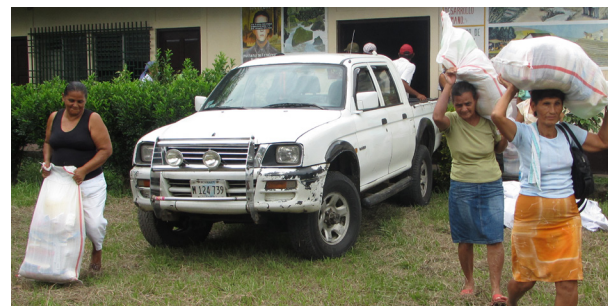
2011 file photo of Achuapa Disaster Relief

Please consider making a donation to this worthy cause.