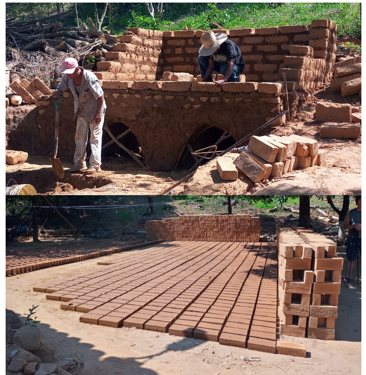
Brick Kiln in La Carreta, Nicaragua

While we were happy to see the new developments, we were also saddened to hear that many young people are leaving Nicaragua to pursue employment in other countries. There just aren't many opportunities for good jobs at home. Continued on page 2