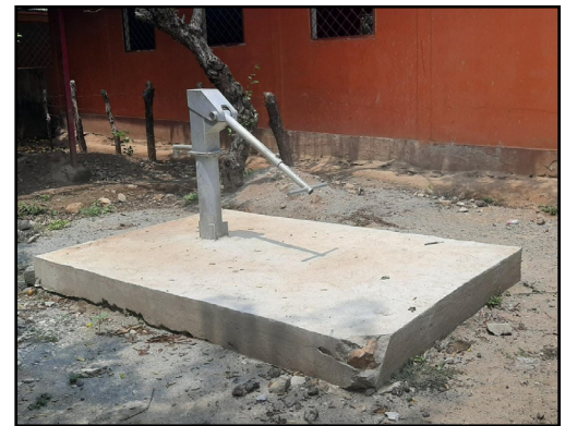
Existing community water supply - hand pump.

Upon completion, as in all infrastructure projects managed by FUNDACCO, follow-up meetings over the course of a year are scheduled with the committee to address any of their concerns and to check on the operation of the system.