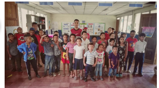
New back pack for everyone

Last year, the Roots of Change Foundation, in collaboration with our sister organization, FUNDACCO, launched a groundbreaking initiative - our very first backpack project. The mission was simple yet profound: to equip students from a humble community school in Los Chupaderos with the essential tools they need for a successful academic journey. As the school year kicked off in February, each student was provided with a backpack filled with essential school supplies.